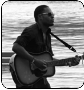
Diamond Jewel Stone '99